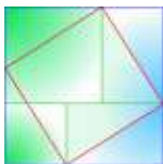
Department of Mathematics & Applications (UniMiB)

Financial support from the Department of Mathematics and Applications of the University of Milano-Bicocca (UniMiB), the Rector's Office of the University of Milano-Bicocca, the Gruppo Nazionale per la Fisica Matematica (GNFM) of the Istituto Nazionale di Alta Matematica (INdAM), and the Ettore Majorana Foundation and Centre for Scientific Culture (EMFCSC) of Erice, is kindly acknowledged.